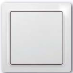
Wireless pushbutton with rocker